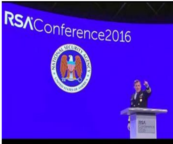
U.S. Navy Adm. Michael S. Rogers, commander of the U.S. Cyber Command and director of the National Security Agency,