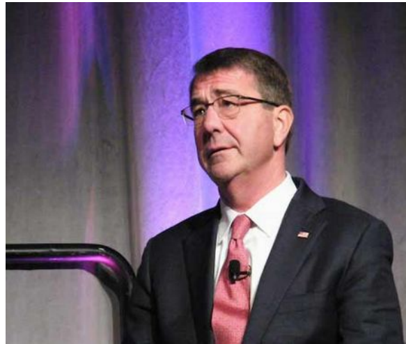
U.S. Secretary of Defense Ashton Carter detailed the new "Hack the Pentagon" effort