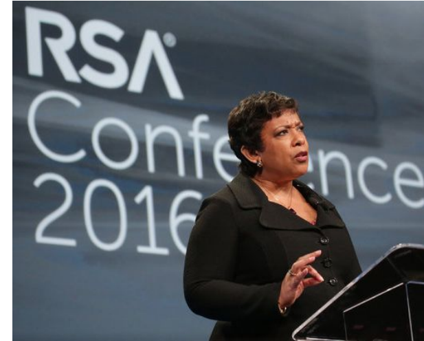
Attorney General Loretta E. Lynch